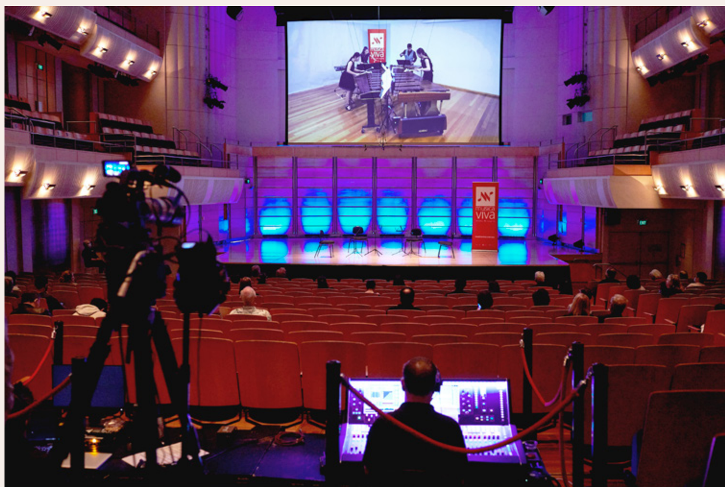
The inaugural Strike A Chord Competition, live-streamed with our partners from the Melbourne Digital Concert Hall from various locations.